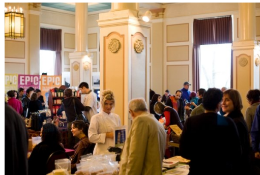
Taken at 2009 Spring Living Fair